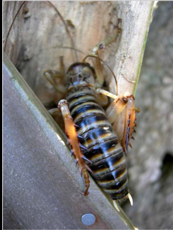
Hemideina femorata (male) Canterbury tree weta