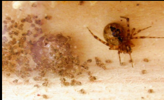
Spider with egg sac & spiderlings