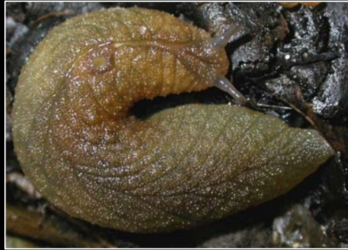
Native leaf-vein slug