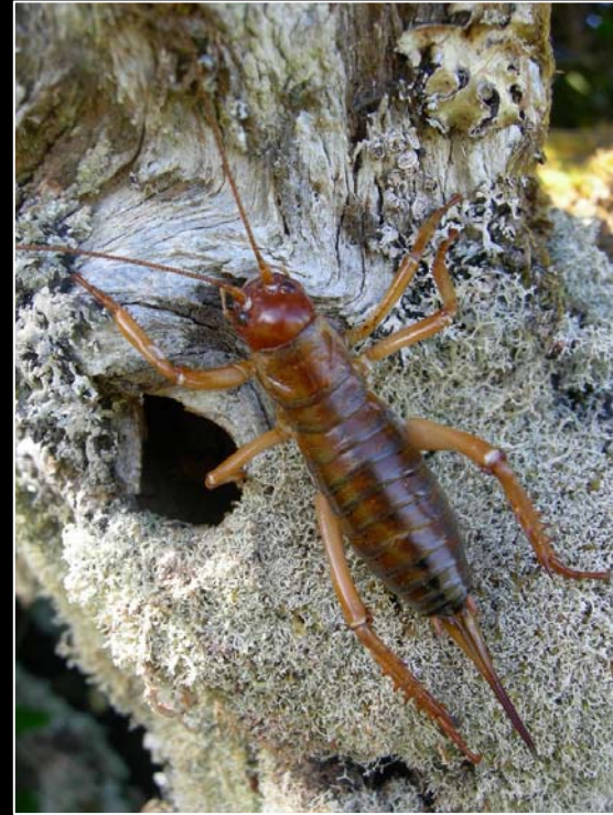
Hemideina ricta (female) Banks Peninsula tree weta